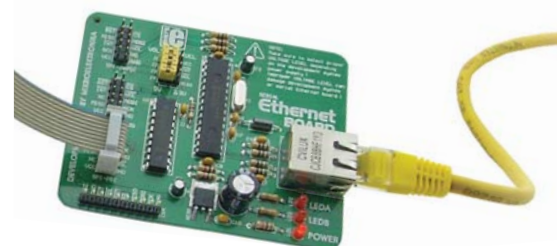
Figure 1. MikroElektronika's Serial Ethernet module with ENC28J60 chip

The control of any home appliance consists of entering control system IP address in the web browser and specifying the desired commands.