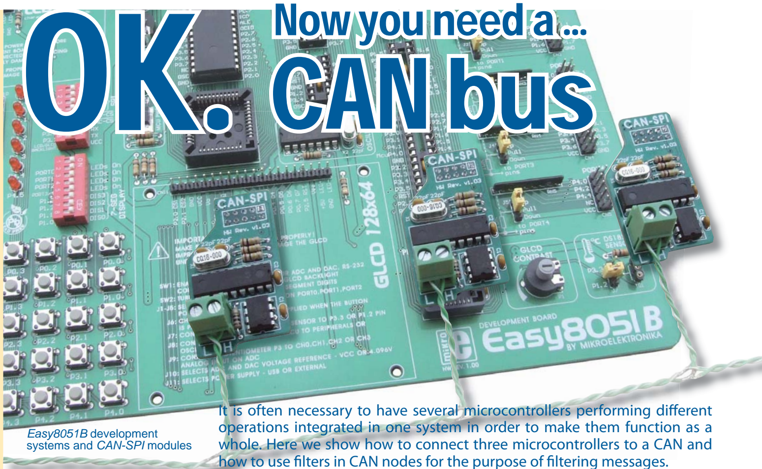
Easy8051B development systems and CAN-SPI modules

By Zoran Ristic MikroElektronika - Software Department