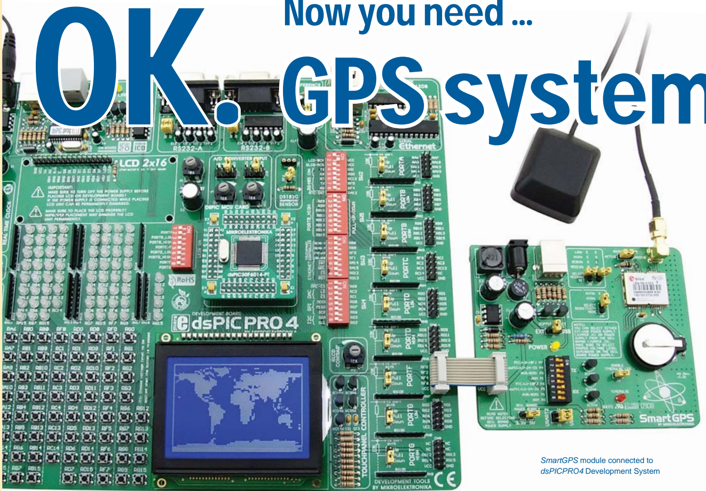
SmartGPS module connected to dsPICPRO4 Development System

By Dusan Mihajlovic MikroElektronika-Hardware Department