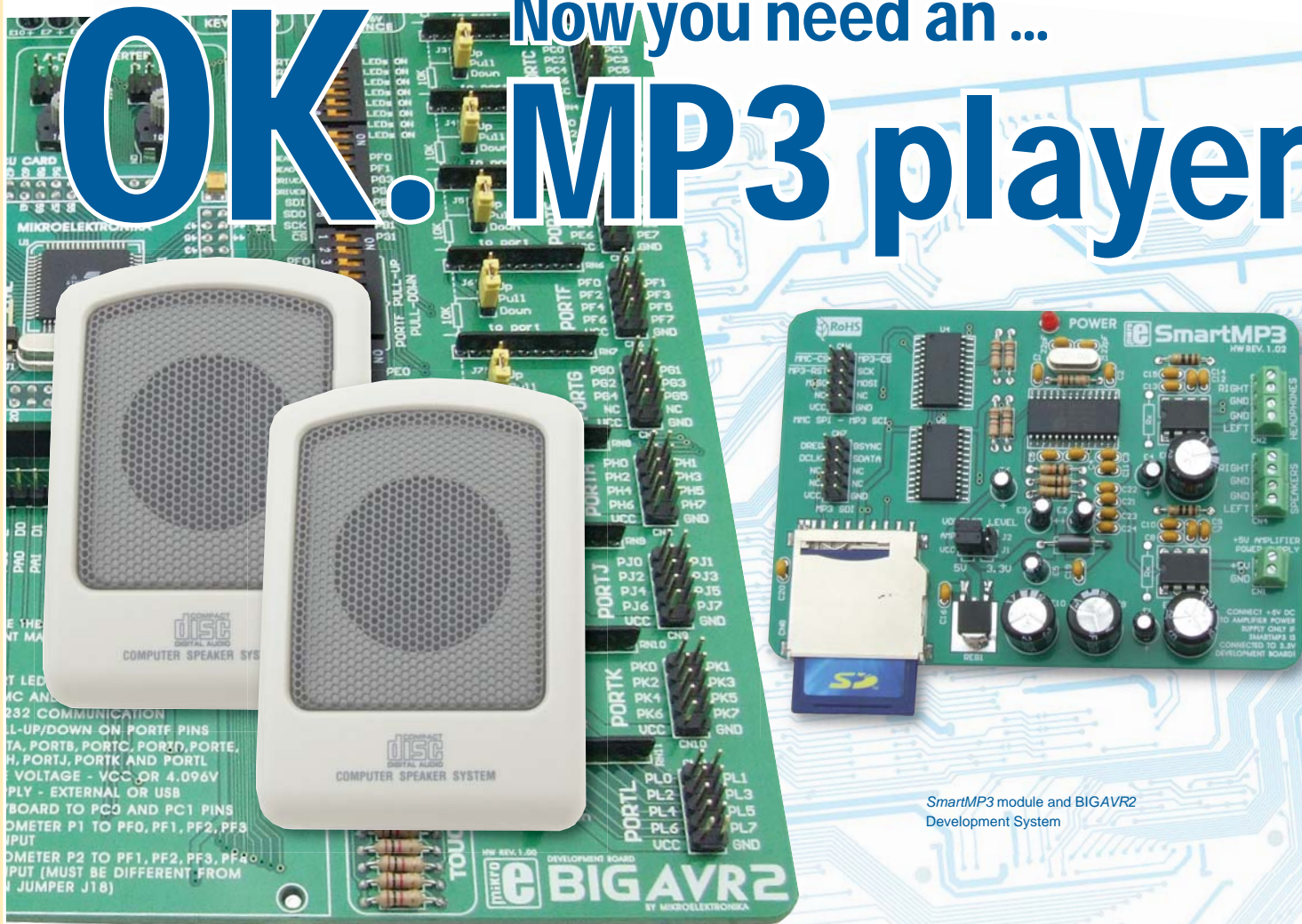
SmartMP3 module and BIGAVR2 Development System

By Milan Rajic MikroElektronika - Software Department