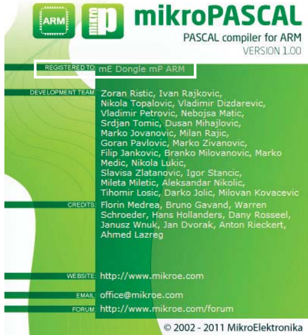
Figure 1-2: mikroPascal PRO for ARM® About Window