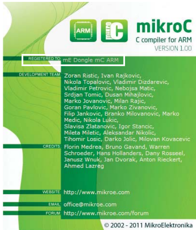
Figure 1-2: mikroC PRO for ARM® About Window