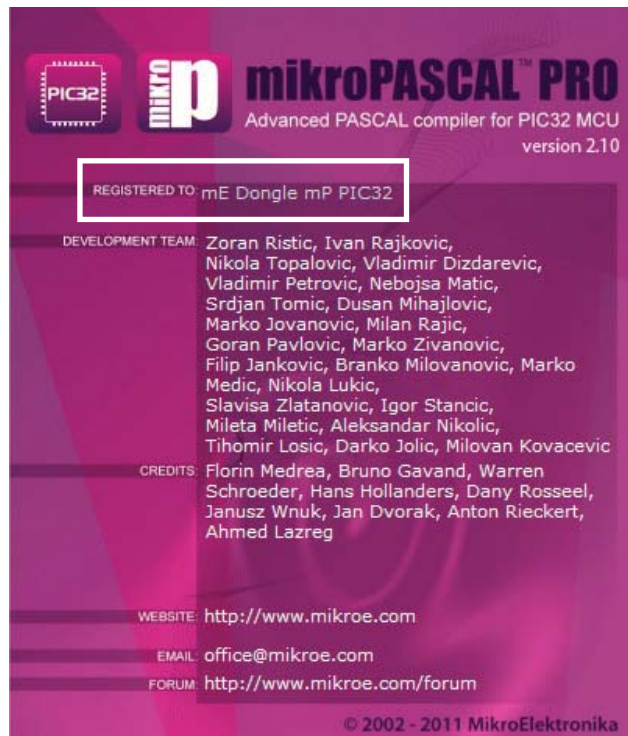
Figure 1-2: mikroPascal PRO for PIC32® About Window