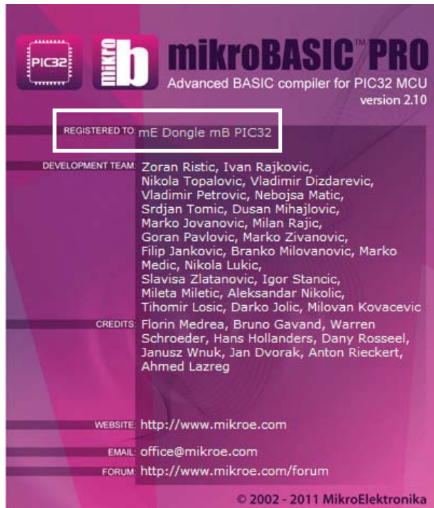
Figure 1-2: mikroBasic PRO for PIC32® About Window