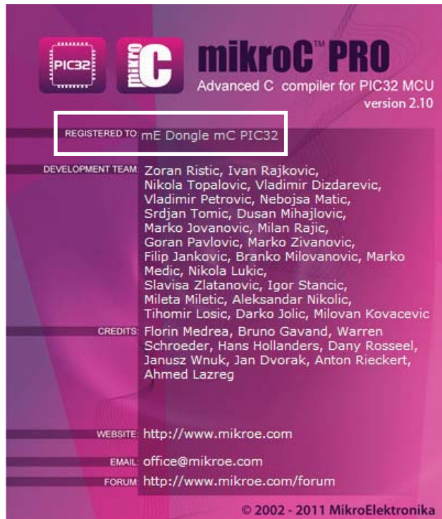
Figure 1-2: mikroC PRO for PIC32® About Window